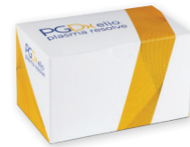
PGDx elio plasma resolve: a focused liquid biopsy research assay

Don't see an existing solution that meets your needs? Contact Partnership@PGDx.com to access additional innovative solutions in our pipeline.