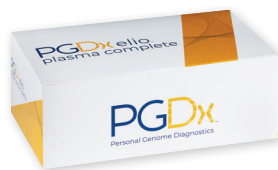
PGDx elio plasma complete: a liquid biopsy CGP research assay