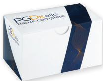
PGDx elio tissue complete: an FDA cleared and CE-IVD marked tumor tissue CGP test